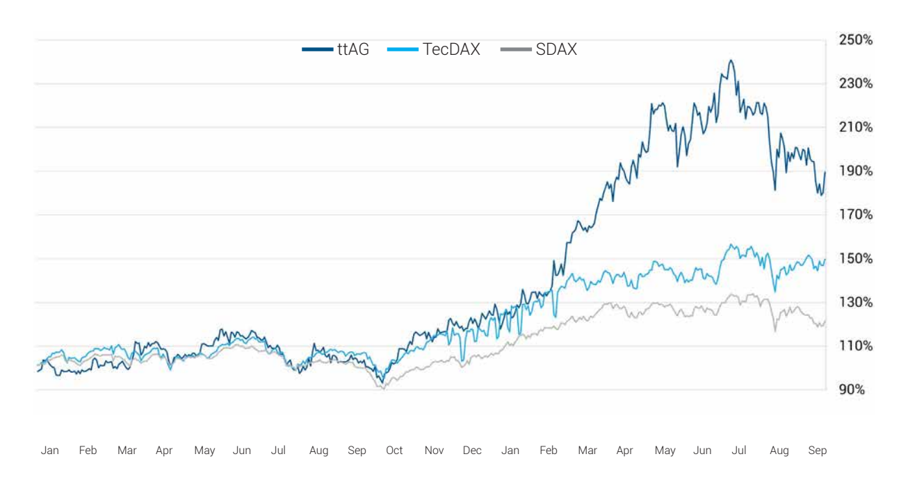
Chart development from 1/1/2014 to 30/9/2015

The analysts' current price targets for technotrans shares range between € 17.00 and € 23.00, and without exception represent recommendations to "buy" or "hold".